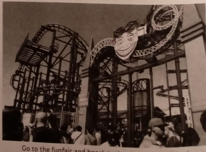
Go to the funfair and beach in the city of Coney Island

Brooklyn, south of Queens and Manhattan, is now one of the trendiest and most attractive areas for young New Yorkers to live, eat and play. It is also one of the most ethnically diverse parts of the city, home to African-Americans, Orthodox and Hassidic Jews, Italian-Americans, Hispanics, Russians, West Indians, Irish and more. There's plenty to see and do in Brooklyn, from visiting the N.Y. Aquarium or doing some vintage shopping in Williamsburg to catching a music, dance or theatre performance at BAM (the Brooklyn Academy of Music) or going to the funfair and beach at Coney Island.