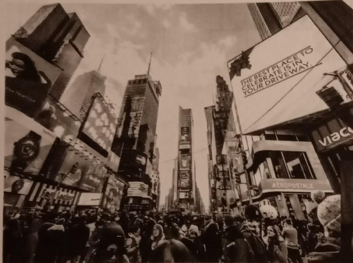
Times Square and Manhattan skyscrapers.

“The City” — as any self-respecting New Yorker calls it — is made up of five boroughs, which were designated in 1898: Manhattan, Brooklyn, Queens, The Bronx, and Staten Island.